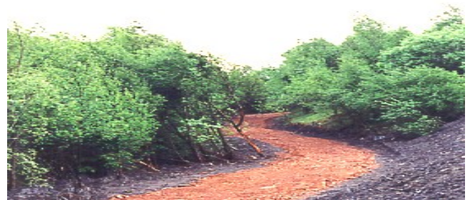
Figure 6: Tree Planting Completes The Site Regeneration

On completion of the project, 50,000 tonnes of sewage sludge filter cake was diverted from landfill and used for ecological and environmental benefit. Flooding has also been eliminated due to the improved drainage on site. To sustain this, mixed woodland and grass was planted over the entire site thereby reducing soil run-off and lagoon silting, see Figure 6. The regenerated woodland and wetland is now a rich habitat for a range of animals and birds.