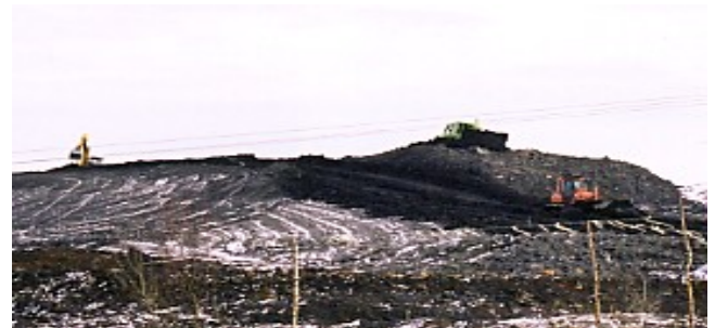
Figure 5: Shaping of Contours

The field trials identified that the VMSR method could be used to remediate the site with an optimum design mix of 3:1 of blaes/shale to sewage sludge cake respectively to a suitable rooting depth. Full scale soil remediation and contour formation took place from August 2000—February 2002.