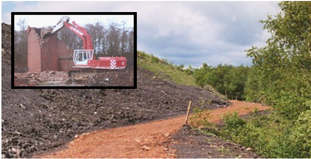
Figure 3: Demolition of Brickworks & Construction of Paths

Work began with the demolition of the old brickworks building. The brick and concrete was crushed and used to form the paths and viewpoints which pedestrians will use after completion of the VMSR regeneration programme, see Figure 3. Representatives of the local communities were encouraged to visit and view the operations under proper supervision.