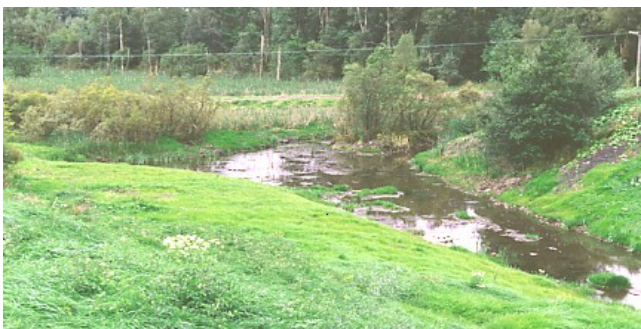
Figure 4: Dredged Settling Lagoon & Drained Area 3

The silted settling pond and outlet was excavated to the clay beds. This process increased the capacity to store surface water run-off and immediately alleviated the flooding in Area 3 shown in the background of Figure 4.