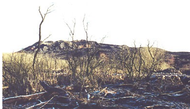
Figure 2: Fifteen Year Old Trees With Stunted Growth

Trees had colonised some parts of the spoil heap, however the lack of nitrogen and phosphorous in the soil reduced the growth rate and prevented natural seeding, see Figure 2.